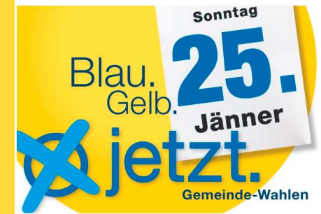
Mank - Gemeinderatswahl 2015 - Mandatsverteilung